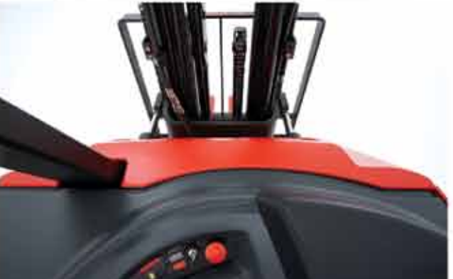
Clear visibility from every angle helps ensure efficient operation.

to the floor level – for efficient handling and stacking, and less product damage.