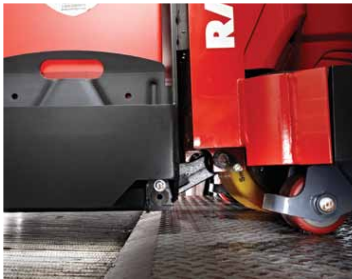
Under clearance without vulnerable parts or components.

Raymond's 8000 Series pallet trucks provide the durability you rely on from the brand you trust.