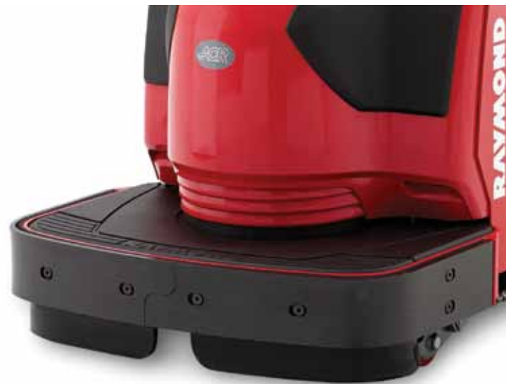
Heavy-duty, optional bumper guard features ½" steel wrapped around a ½" rubber core to further absorb and diffuse impacts from the frame and components.