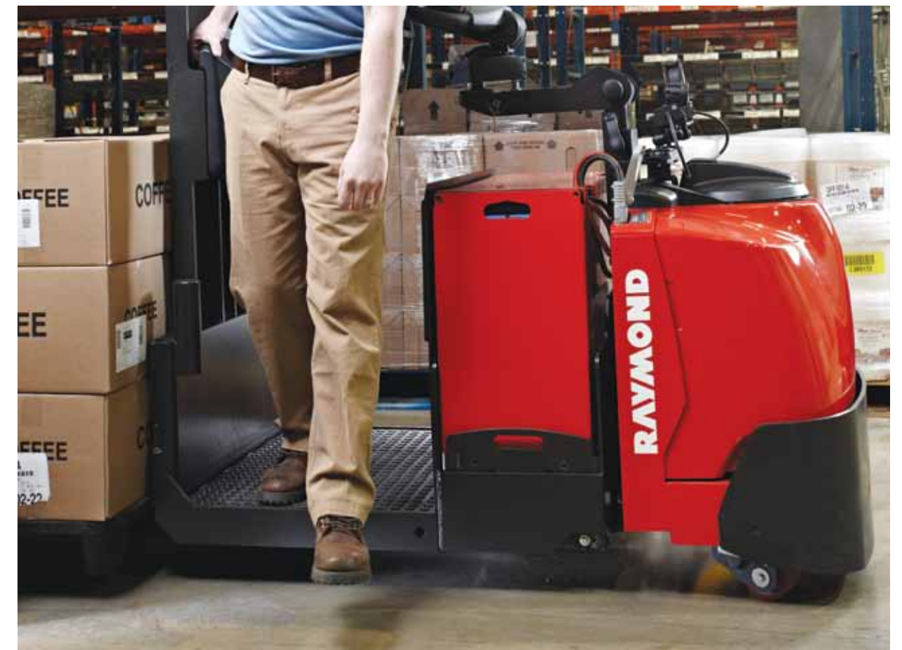
Easy step-through access to either side of the aisle comes standard with roomy operator compartments on Raymond's Model 8510 center rider pallet truck and Model 8610 tow tractor.